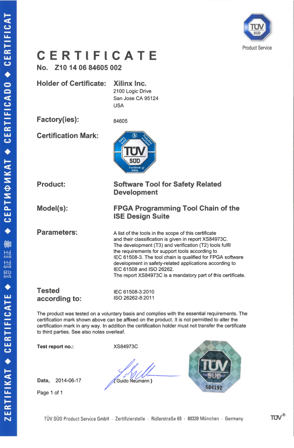
Figure 2: Certification