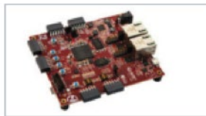
Avnet Artix-7 50T FPGA Evaluation Kit