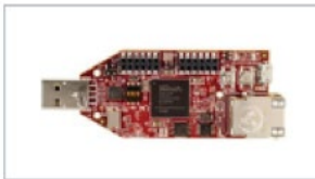
Avnet Spartan-6 Lx9 FPGA Microboard

See the full selection of boards and kits targeting cost-sensitive applications.