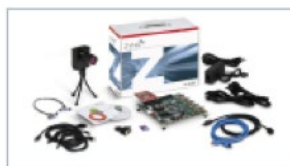
Zynq-7000 All Programmable SoC Video and Imaging Kit