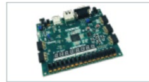
Diligent Nexys™4 Artix-7 FPGA Board