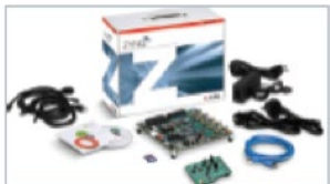
Zynq-7000 All Programmable SoC ZC702 Evaluation Kit