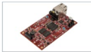
Microzed Evaluation Board