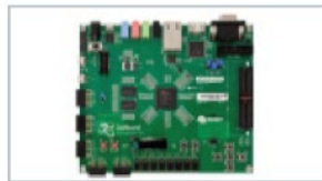
Zynq-7000 All Programmable SoC ZC702 Evaluation Kit