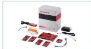
Ted Spartan-6 FPGA Consumer Video Kit 2.0