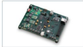
Zynq-7000 All Programmable SoC Zedboard