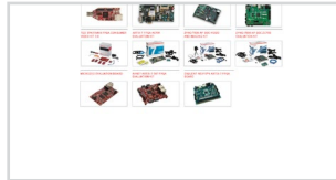
Artix-7 35T Arty FPGA Evaluation Kit