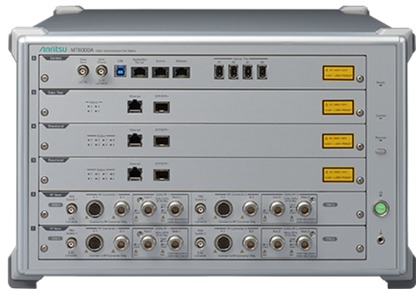
Figure 1. Anritsu MT8000A Radio Communication Test Station