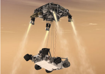
MARS2020 (July 2020 Launched)

Instruments: MAHLI (Imager – XQR2V3000), ChemCam (Remote sensing instruments – XQ2V1000), Electra-Lite (Communications – XQR2V3000) and MALIN (Processor – XQR2V3000)