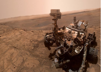
Curiosity (still going strong)

Lander: XQVR4000XL – Control Pyrotechnics that control various stages of maneuver for landing Rover: XQVR1000 – Motor Control Board (wheels, steering, arms, cameras)