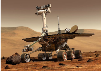
Spirit & Opportunity (now retired)

Lander: XQVR4000XL – Control Pyrotechnics that control various stages of maneuver for landing Rover: XQVR1000 – Motor Control Board (wheels, steering, arms, cameras)