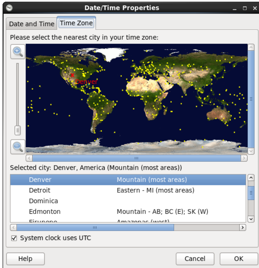
Figure 4-2: Date/Time Properties Dialog Box

The Date/Time Properties dialog box opens.