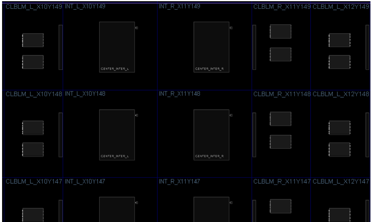
Figure 1: INT Tile Locations