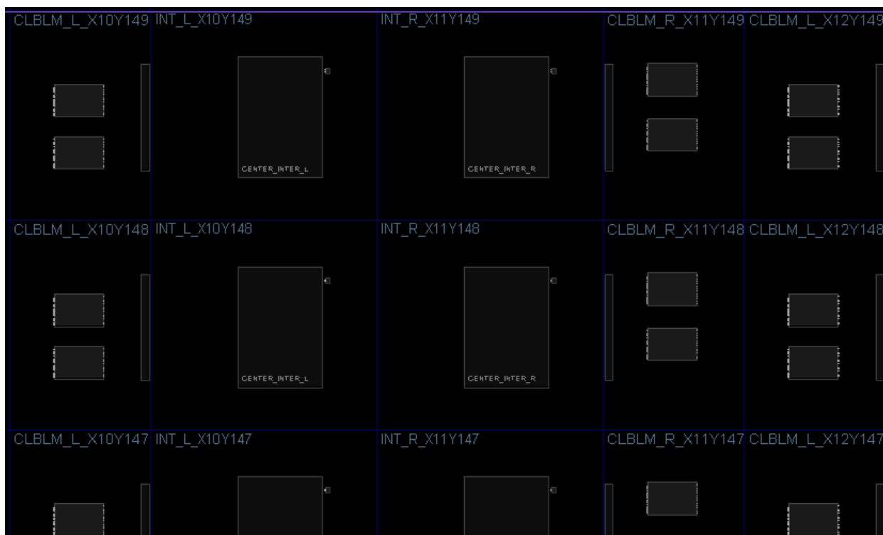
Figure 1: INT Tile Locations

When you zoom in, you see INT locations as shown in Figure 1 (routing resources are hidden to simplify this image):